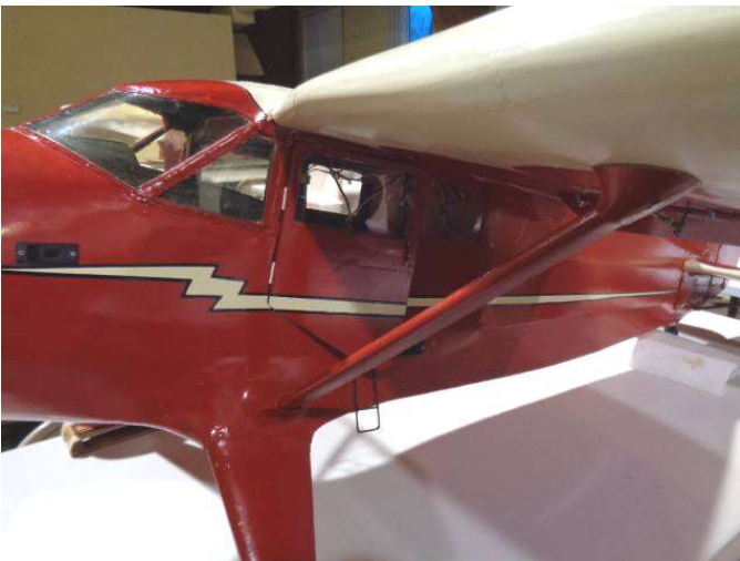
The Stinson Reliant.