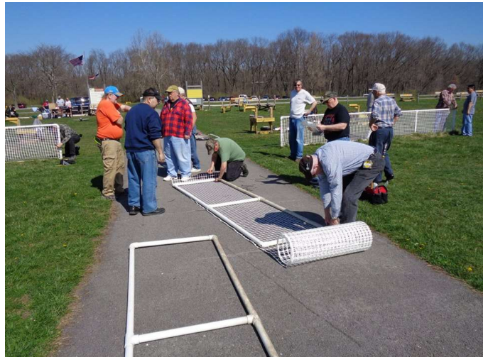
Safety fences assembled and installed at the field. Thanks to all the volunteers.