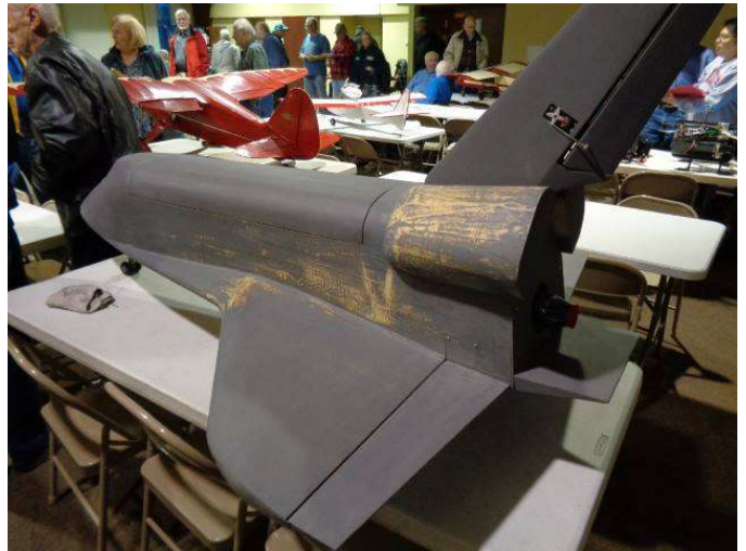
Joe Felonk's Space Shuttle (after re-entry?).