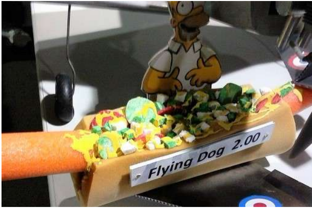
The "flying" hot dog.