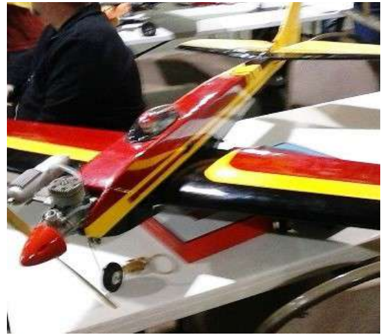
A completely refurbished Taurus.