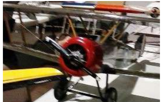
A Sopwith Pup/Camel needing some repair.