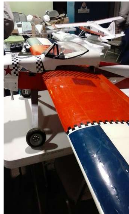
A Stinger needing some rework.