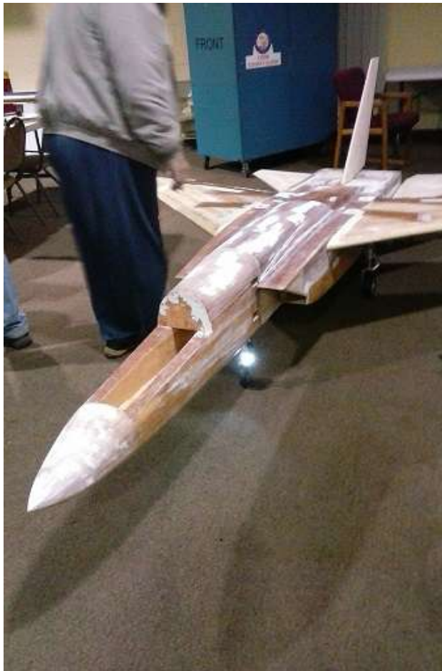
An A-5 Vigilante.