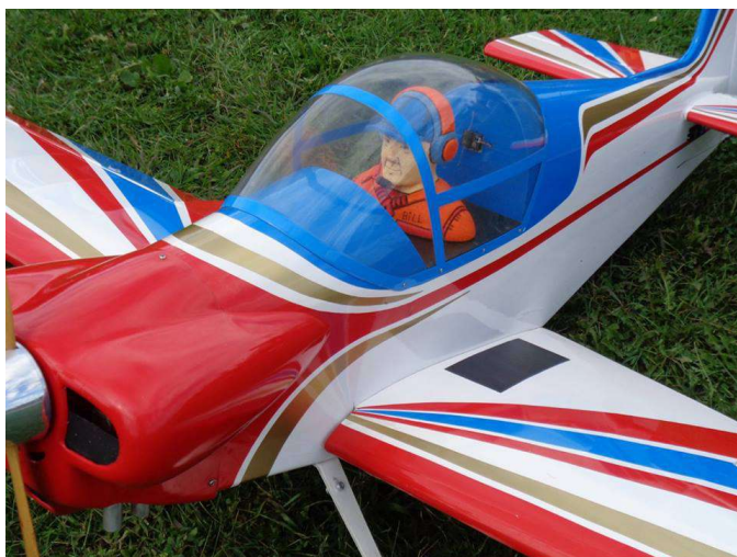
Corby Starlet homebuilt.