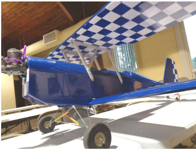
The Lazy Ace built from a kit.