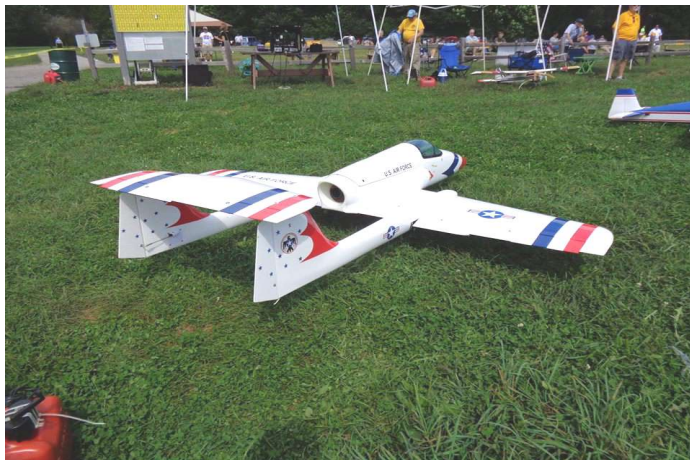
The Boomerang XL jet.